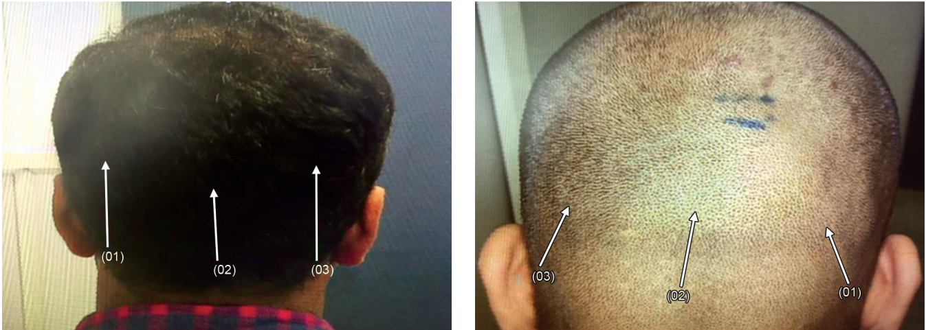
Fig. 1: Prominent markings on the safe donor region, for digital image analysis